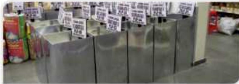
LOOSE ITEM BOX